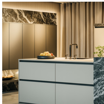
Above and below: SimiLaque plus in Agate Gray velvet matt and Graphite Gray velvet matt