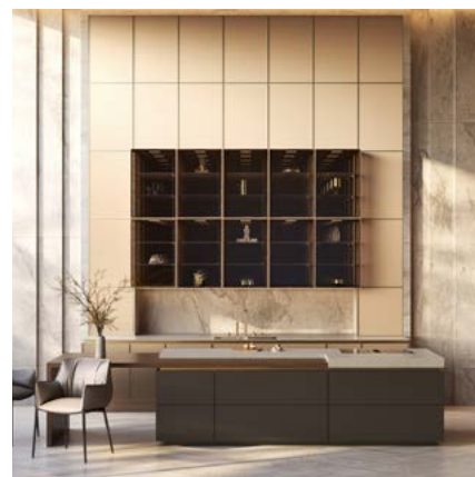
Above: S2 “hidden” features offer interplay of visible and invisible; below: Debuted during Milan Design Week, S2 “secret” solutions offer luxury of expanded and concealed spaces