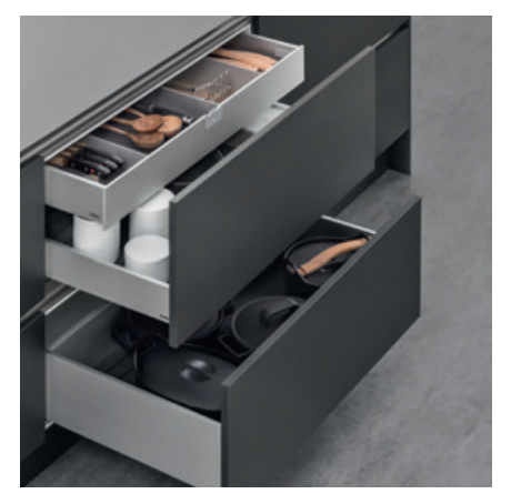
Above: Flexible new accessories system; Below: Redesigned drawers