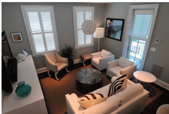
9336: LIVING AREA