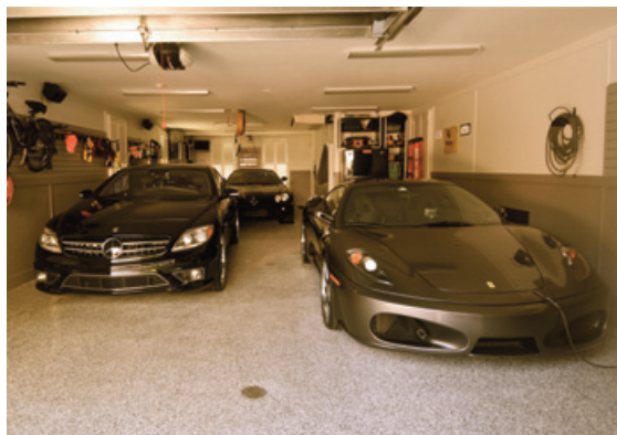
9235_2: GARAGE 1