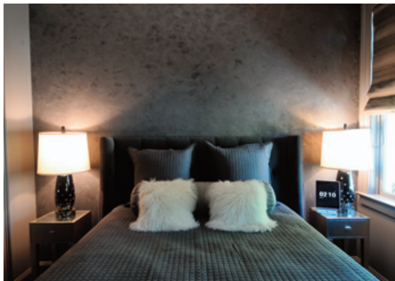
9358: MASTER SUITE 1