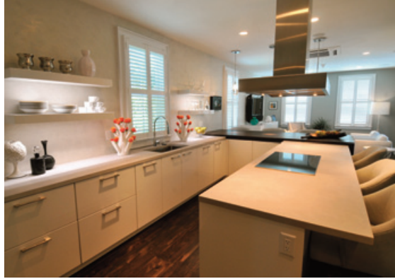
9298: KITCHEN 1