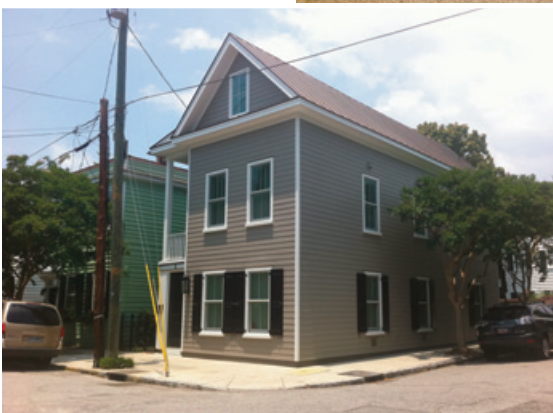
Keating Residence, Charleston, SC

Most of the time, a garage comes about as the result of a home. It's not very often that it's the other way around. But that's exactly what happened in a historic area of Charleston, South Carolina when a young couple set about building a garage for their collection of ultra-luxury cars. Throw in a contemporary kitchen and a