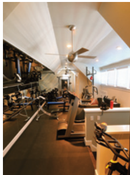
9275: GYM 1