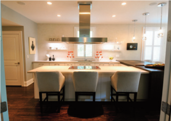
Gourmet Kitchen on second floor by Kitchen Designer Vinson Blanton

The temperature-controlled garage, which takes up the entire first floor of the