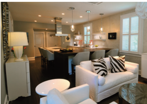
View of the kitchen from the media area

Featuring SieMatic's SE 5005L cabinets in Lotus White Gloss, the streamlined kitchen feels more like furniture than cabinetry. Clean lined and lacking bulk, the modern, horizontal lines of the style