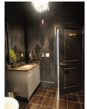
9348: MASTER SUITE 2