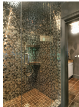
9352: MASTER SUITE SHOWER