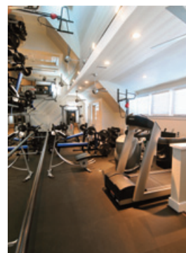
Gym on third level

Part weekend retreat, part car showroom and part art gallery (the whole home is outfitted in art from Robert Lange Studios), this modern masterpiece brings the sensibilities of today's metropolitan city to historic Charleston.