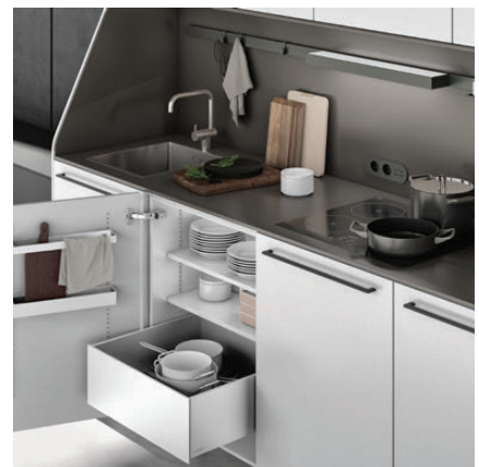
Above: SieMatic 29 sideboard – signature piece of URBAN style collection and recipient of German Design Award 2016; below: Award-winning SieMatic 29 – a myriad of functions in a small space